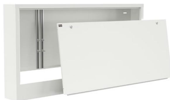
SGN - 6