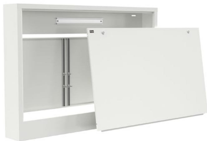
SGN WG - 6