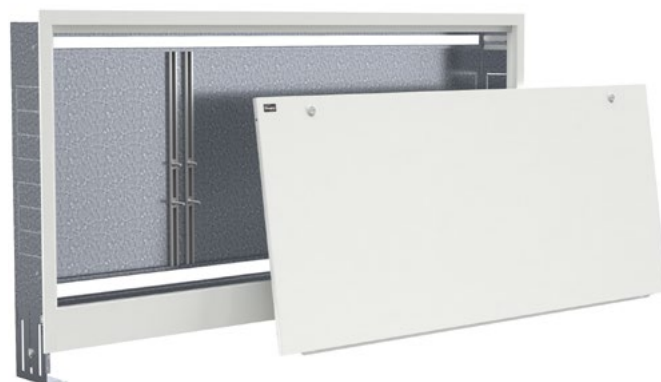
SGP - 6