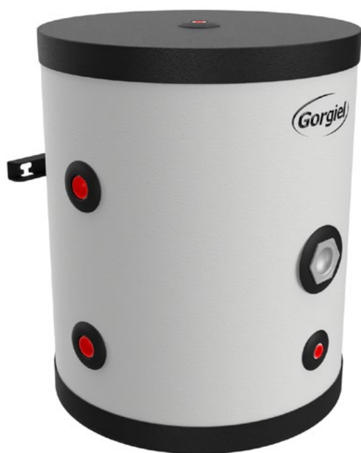
ZBG 60 G